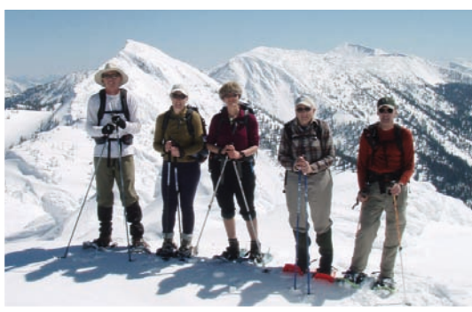
Infinity Ridge - At the top