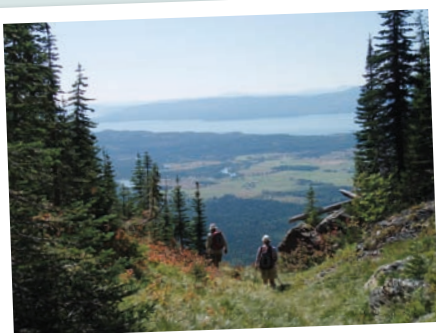
Swan Rangers in the high country above Flathead Lake