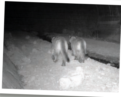
Mountain lion pair in Wildlife Crossing

Thirty-nine fish and wildlife-crossing structures have been constructed. Crossing structures were placed along the highway corridor in areas that would mimic natural wildlife movement; such as drainages and along creeks and rivers. Also, known areas of high animal vehicle collision density were targeted. The CSKT, MDT, and Western Transportation Institute (WTI) have been monitoring wildlife use of the crossing structures for the past two years. The initial results show that numerous wildlife species and individuals are using these structures daily. We expect use to increase as time passes and wildlife become more familiar and trusting of these new structures on the landscape.