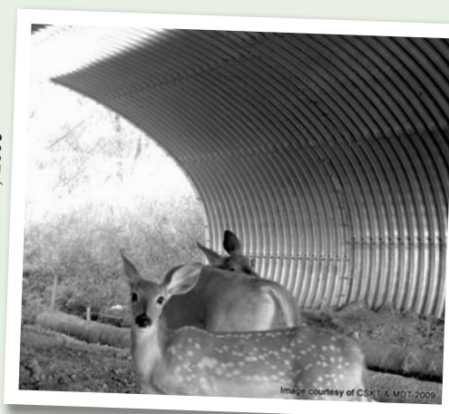
Deer using Wildlife Crossing

As a predominant feature on the landscape, US 93 was a narrow 2-lane highway bisecting the FIR from north to south. It is the main transportation route for numerous types of traffic between Interstate 90, Montana's major east-west thoroughfare, and all points north including Flathead Lake, Glacier National Park, and Canada. There are daily local commuters, freight trucks moving goods, and seasonally high recreational traffic. Crash levels were not only above statewide rates, but