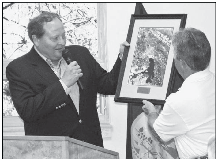
Governor Schweitzer receives the 2010 Stewardship Award.

Although Premier Campbell was not able to be present, Naomi Yamamoto, B.C. Minister of State for Intergovernmental