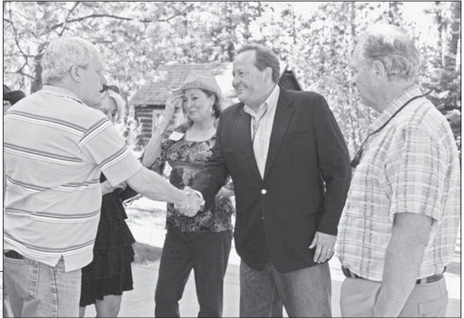
Members greet Governor Schweitzer.