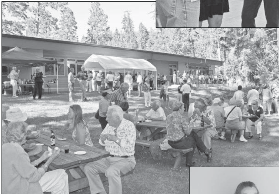
Socializing by the lake.